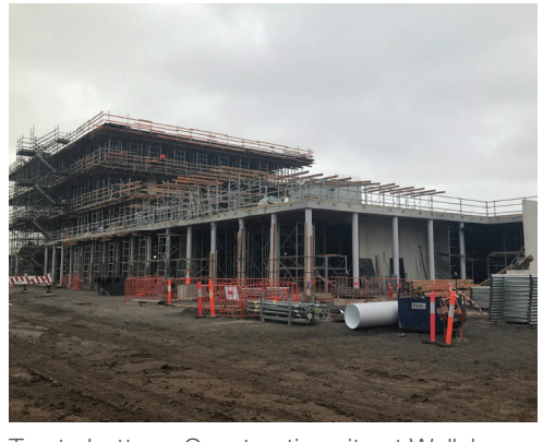
Top to bottom: Construction site at Wollahra Primary School, Duncans Road Interchange works, Cherry Street Level Crossing removal, new Werribee Police Complex.